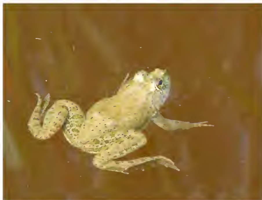
Fig. 2D. Skittering Frog Euphlyctis cyanophlyctis .